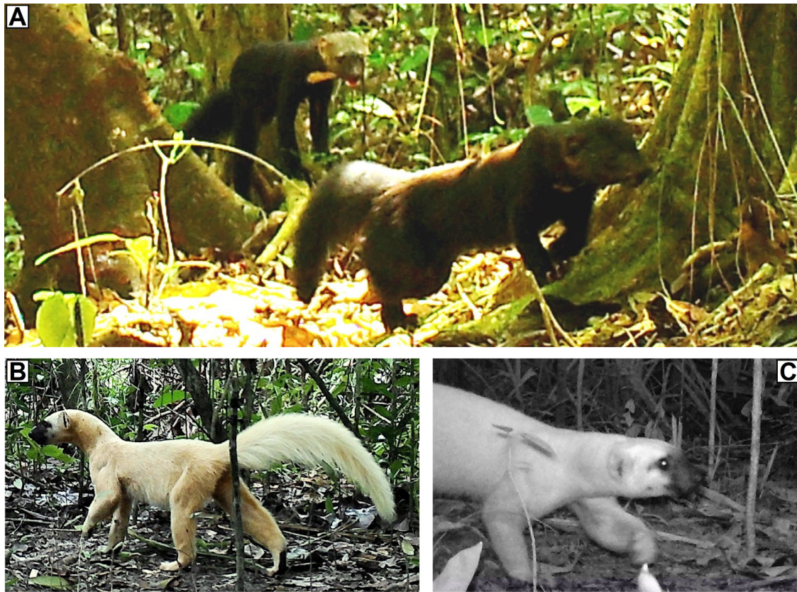
Figure 2. Coloration of tayra ( Eira barbara ) photographed at different camera-trap locations on Maracá Island, Roraima state (Brazil). A – pair with normal coloration; B and C – leucistic tayra registered a month apart, 1.4 km distant from each other. Full quality images are available at https://figshare.com/s/ebe743ecb15b32d7f25c .