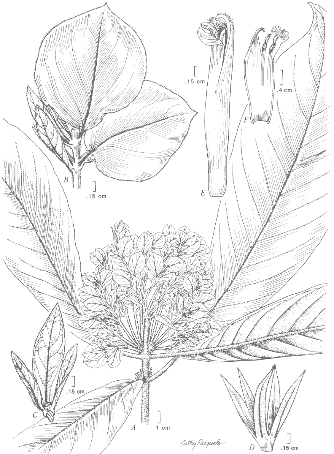
Fig. 1. Justicia zarucchii Wasshausen (Zarucchi et al. 2971): A, habit; B, dorsal and ventral bracts, bractlets and calyx segments; C, ventral bracts and bractlets; D, calyx; E, corolla; F, corolla expanded.