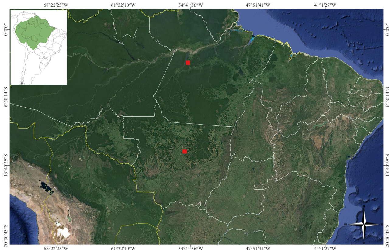
Figure 3. Geographical distribution (red squares) of Drepatelodes cabana Orlandin, Piovesan & Carneiro sp. nov. Map created using the Free and Open Source QGIS.

Etymology. The name is a tribute to the Cabanos, indigenous, black, and mixed-race people who, between 1835 and 1840, led the Cabanagem, one of the largest popular movements in Brazil against the exploitation of the ruling class. The Cabanagem Revolt occurred in the province of Grão-Pará, a region that today comprises the Amazonian states of Amapá, Amazonas, Pará, Rondônia, and Roraima.